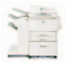
HP LaserJet 9050mfp with optional stacker