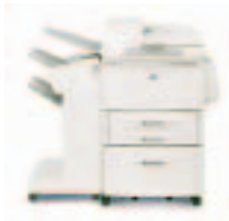
HP LaserJet 9040mfp with optional stacker