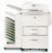
HP LaserJet 9040/9050mfp with 8-bin mailbox

Power cord, print cartridge, printer documentation, printer software CD-ROM, control panel overlay, two standard 500-sheet input trays, 100-sheet multi-purpose tray, 2000-sheet input tray, automatic duplexer accessory (pre-installed), HP Jetdirect Embedded Print Server, automatic document feeder (ADF), entitlement to product installation. Necessary paper output device to be chosen and ordered separately.