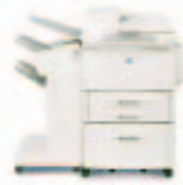
HP LaserJet 9040/9050mfp with stacker

Each mailbox bin can be assigned to an individual, workgroup or department for easy job retrieval. The mailbox may also be configured as a sorter/collator, stacker and job separator.