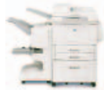
HP LaserJet 9040/9050mfp with multifunction finisher

Provides 3000-sheet stacker capabilities as well as multiposition stapling for up to 50 sheets of paper per job.