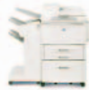
HP LaserJet 9040/9050mfp with stapler/stacker

Stacks up to 3,000 sheets of paper with job offset.