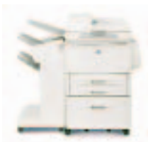
HP LaserJet 9050mfp with optional stacker